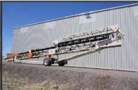
2019 36"x100' Radial Stacker single axel c/w brakes & lights, power fold, raise & lower, travel & hyd axl raise, landing jacks, 100 ft cord pkg, fresh safety P.O.R.