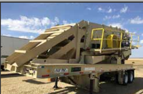
2018 Fab Tec Wash Plant 5x16 3 Deck Screen 36"x 25' FMSW, hyd screen and slurry box raise, P.O.R.