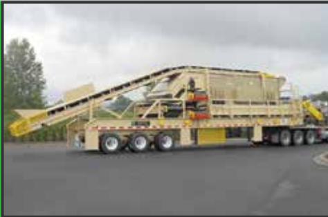
2018 Portable Model P7203 IOC Screen Plant Tri-axle chas. c/w brakes & lights, 2018 C/R 7x20 3 deck hor. screen, 50HP screen drive motor, 42" O/H feed belt w/ 20HP drive motor, 72" U/S belt w/ 20HP motor, (2) 36" cross belt w/ 7.5HP mot. head pulleys, belt scrapers on all belts, (4) hyd. levelling legs, 100" cord pkg., c/w cord ends P.O.R.