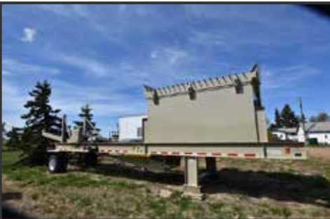
New 3033 Feeder 30" U/H belt, 36" discharge belt, hyd. grizzly with 6" spacings, single axel, brakes & light, 100 ft cord pkg. P.O.R.