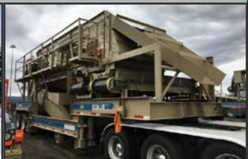
2018 New Portable Wash Plant 6x20 3 deck screen, twin 36" screw, (2) cross conveyors, plant mounted electrical, sprat bars, slurry feed box P.O.R.