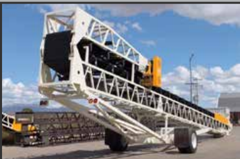
2019 36"x80' Radial Stacker single axle, brakes & lights, power raise, lower, fold & travel, hyd. axle jacks, landing jacks, 100 ft cord pkg., fresh safety P.O.R.