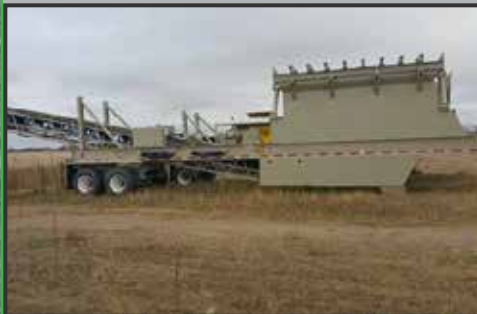
New 4242 HD Belt Feeder 42" feed & 42" discharge belt, hyd. grizzly with adjustable bars, 16" spacings, cord pkg. 2019 safety P.O.R.