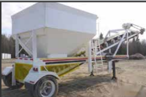
Elrus 20 Yd. Surge Bin new 42" discharge belt, 100 ft cord pkg, 2018 safety $43,900