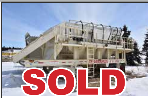
2013 C/R 7x20 2 Deck Wash Plant Tandem axel c/w brakes & lights spray bars on both decks, slurry feed box, product chutes, under screen flume, 40 HP electric motor, fresh 2017 safety $189,000