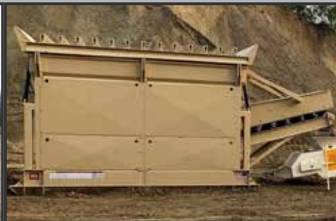
2018 XHD 20 Yd. Skid Feeder c/w hyd grizzly, 6" spacings, 36" dis. belt, built out of 1/2" weldox plate, feeder weight 35,000 lbs, hyd. drive P.O.R.