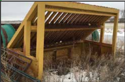
Stationary Grizzly 6" grizzly bar spacings, used very little. $18,900