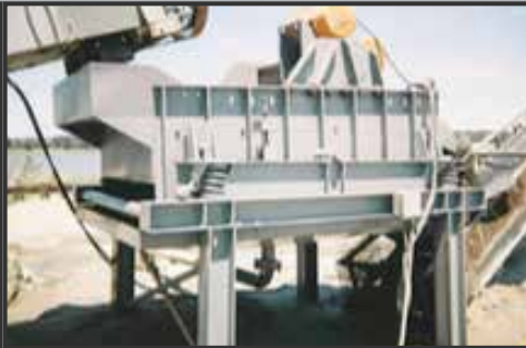
2018 Superior 4x8 De-Watering Screen c/w 0.25 poly screen media, twin 7.5 electric motors, support structure P.O.R.