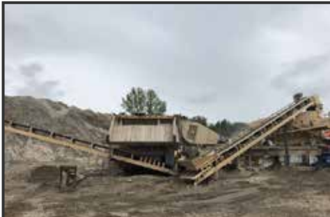
1998 Kolberg All-in-One Plant Pioneer 36"x14' vib. grizzly feeder, Pioneer 20"x36" jaw crusher, Telsmith 36" cone crusher, Pioneer 4'x14' 3 deck screen, triple axle chassis, brakes & lights, 30"x15' return conv., 20' sea c/w Cummins 300 KW gen set & elec. to run plant, all in good working order, recent jaw plate & liner change. PKG PRICE $495,000