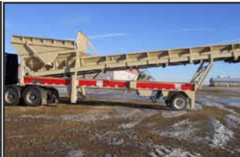
2015 15 Cu. Yd. Rec. Single Stage Feeder NEW 48" vul. belt discharge conv., hyd. grizzly 6 1/2" spacings, hud. conv. drive w/ adj. spd., reconditioned, new hyd. pump, 2018 safety $119,800