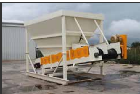
2018 14 Cu. Yd. Skid Feeder 36" vulcanized discharge belt, belt scraper, 100 ft cord pkg $39,900