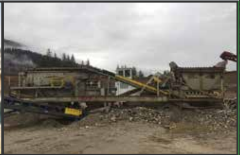
El-Jay 1213 Portable Cone Plant 45" cone, 5x16 3 deck screen, 312 KW power van, (2) 36x60 pit portable radial stackers, PKG PRICE $395,000