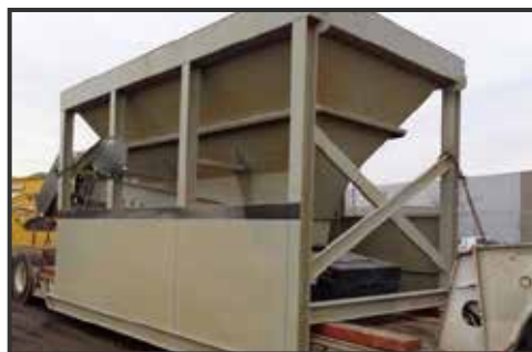
2015 20 Yd. Skid Feeder 36" discharge belt, electrical panel with controls. $65,000 USD