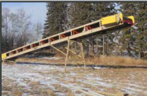
2017 (1) Spomac 36"x60' and (3) 30"x50' Transfer Conveyors vulcanized blet, belt scraper P.O.R.